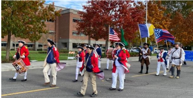
Fife and Drum Corps